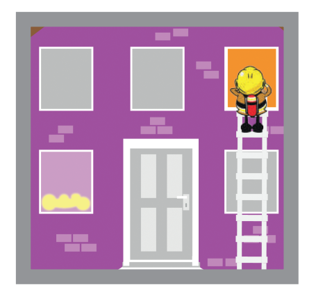
Wait for the fire fighters to get you out.