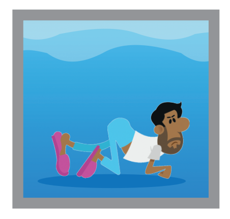
Because smoke is hot it rises, which leaves cleaner air at level.