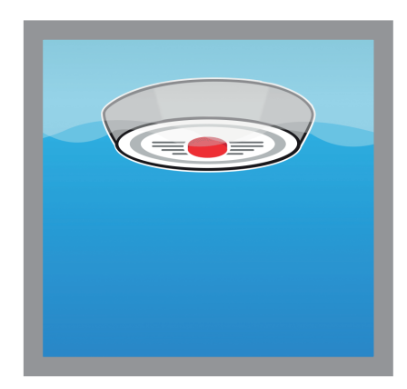
The smoke alarm bleeps loudly to warn that there's a fire