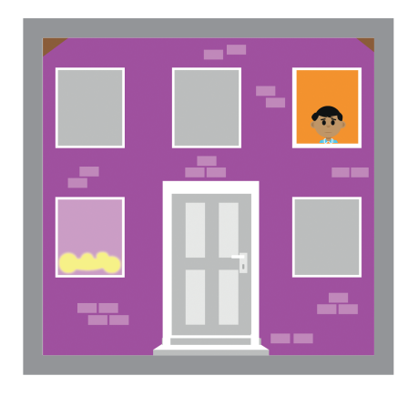
Stay by the window. Do not try to jump out.