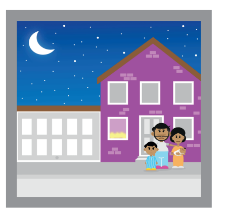
Once you are out, you stay out.