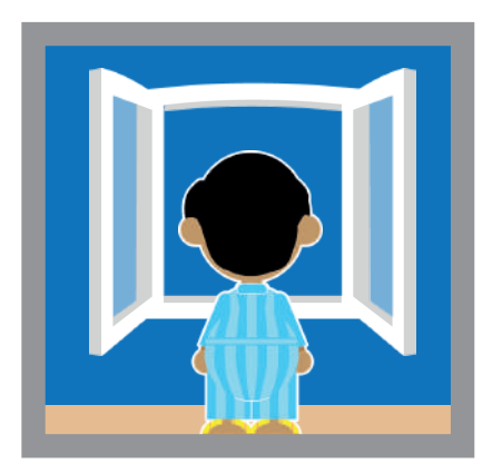
Open the window. Ring 999 and shout "help fire!"