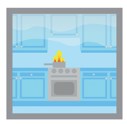
A pan catches fire in the kitchen

FILL IN THE BLANKS TO COMPLETE THE FIRE ESCAPE STORY