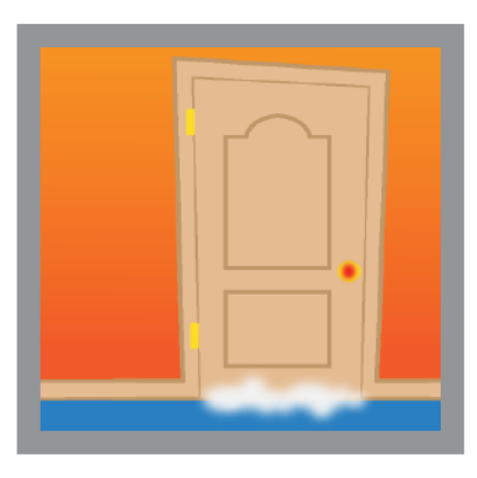
If your bedroom door is hot do not open it.