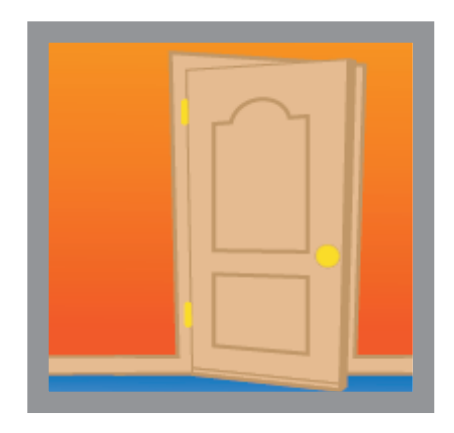
Close the door behind you to stop poisonous smoke from spreading and to starve the fire of oxygen