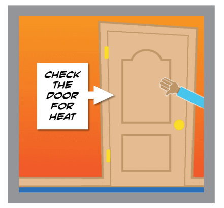
He checks the bottom, the top the middle and finally the door handle with the back of his hand, to see if it is hot