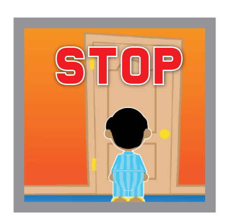
Omar has to make sure that it's safe to open his bedroom door